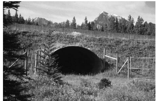
Fig. 2 - A landscape bridge (Photo by Luchtfotografie Slagboom en Peeters) and an underpass (Photo by B. Iuell)

Some measures have been well tested and considerable experience has accumulated. Others are new and still being developed and tested. The amount of information presented for each measure reflects this disparity, but best practice according to current knowledge and experience is presented. This means that some recommendations may be different from those in existing handbooks, especially the earlier ones. In some cases, recommendations in a particular country may differ from the ones presented here because they take into account regional issues such as a specific climate or habitat.