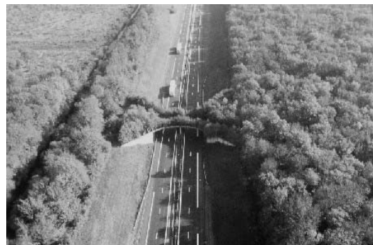
Fig. 1 - Transportation infrastructure can fragment habitats, but habitat fragmentation can be mitigated by building fauna passages.

Mitigation of these adverse effects on wildlife to obtain an ecologically sustainable transport infrastructure needs a holistic approach that integrates both the social and ecological factors operating across the landscape. Hence, one of the challenges for ecologists, road-planners and engineers is to develop adequate tools for the assessment, prevention and mitigation of the impacts of infrastructure. It has been the task of the COST 341 Action to address the issues associated with Habitat fragmentation due to transportation infrastructure . (COST is an intergovernmental framework for European Co-operation in the field of Scientific and Technical Research, allowing the co-ordination of nationally funded research on a European level. COST Actions cover basic and pre-competitive research as well as activities of public utility. COST has 33 member countries.)