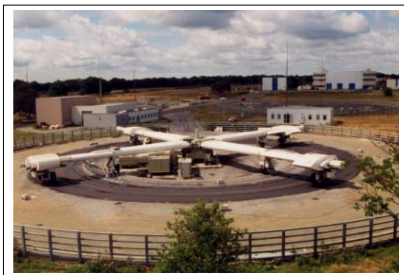
Figure 1 - LCPC Carousel and fatigue test track.

The LCPC fatigue test track was developed for research on the mechanical behaviour of road structures subjected to heavy traffic. Loads are applied on the pavement by means of a four-arm carousel (Figure 1).