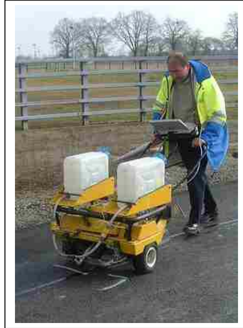
Figure 3 – Griptester device

Static texture measurements included sand patch measurements, giving mean texture depth (MTD), and profile measurements, giving information about sharpness of surface asperities and macrotexture and microtexture of the test surface.