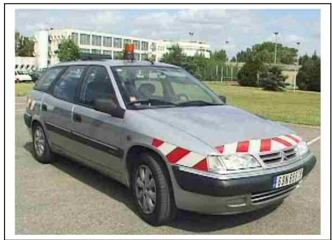
Figure 7 – Xantia device