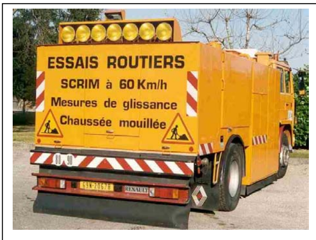
Figure 6 – SCRIM device

On this road circuit of 120 km long a lot of measurements have been done during the three years of the TROWS project. Macrotexture and megatexture measurements with the mlpc device named RUGO. Sideway force coefficient (SFC) measurements with the SCRIM device of the CETE of Lyon (Figure 6). Transverse and longitudinal accelerations with the Xantia device of the CETE of Lyon (Figure 7). Roughness indices, geometric characteristics measured with the ARAN device from VIAGROUP Company. Traffic information has been collected on all the sections of the circuit and four different passages have been done with the SCRIM device. Two tables have been built to quantify on one hand the aggressiveness of the road on the tyres and on the other hand the aggressiveness of the tyres on the road surfaces.